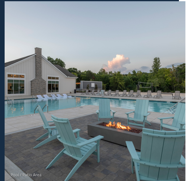
Pool / Patio Area